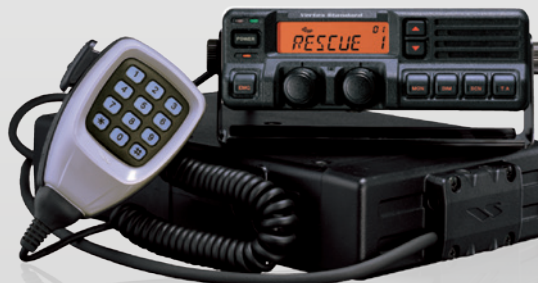
REMOTE MOUNT CONFIGURATION